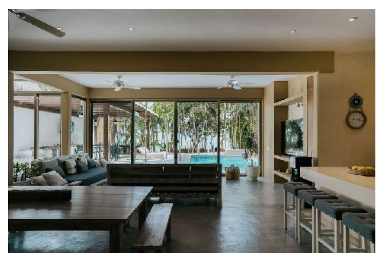
Eco-Friendly Paradise - Casa Xixim

Casa Xixim is an eco-friendly paradise that combines luxury with sustainability. This stunning villa is designed with eco-friendly materials and features solar panels, rainwater harvesting systems, and organic gardens. Immerse yourself in nature and enjoy the tranquility of the surrounding jungle and pristine beach. Casa Xixim offers a truly unique honeymoon experience that allows you to connect with the environment while indulging in luxury and comfort.