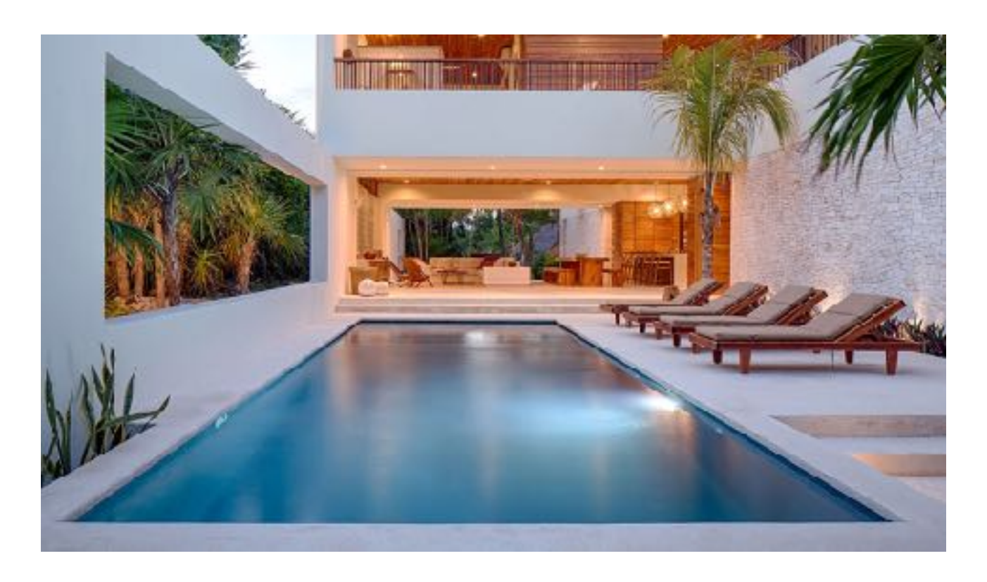
Casa Xixim I Tulum Villas I Haute Retreats