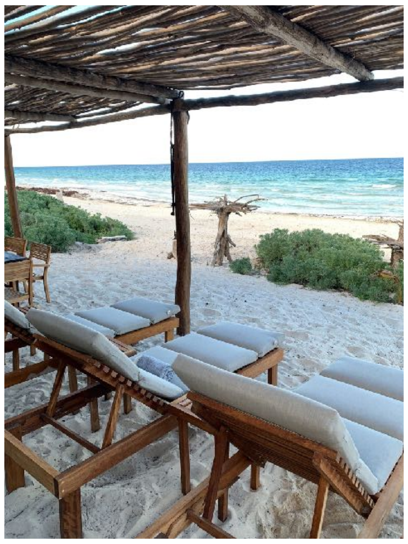
Private Oasis in the Jungle - Casa Aviv Tulum

Experience the ultimate retreat at Casa Aviv, a haven tucked away in the enchanting jungle in Tulum. This contemporary private residence