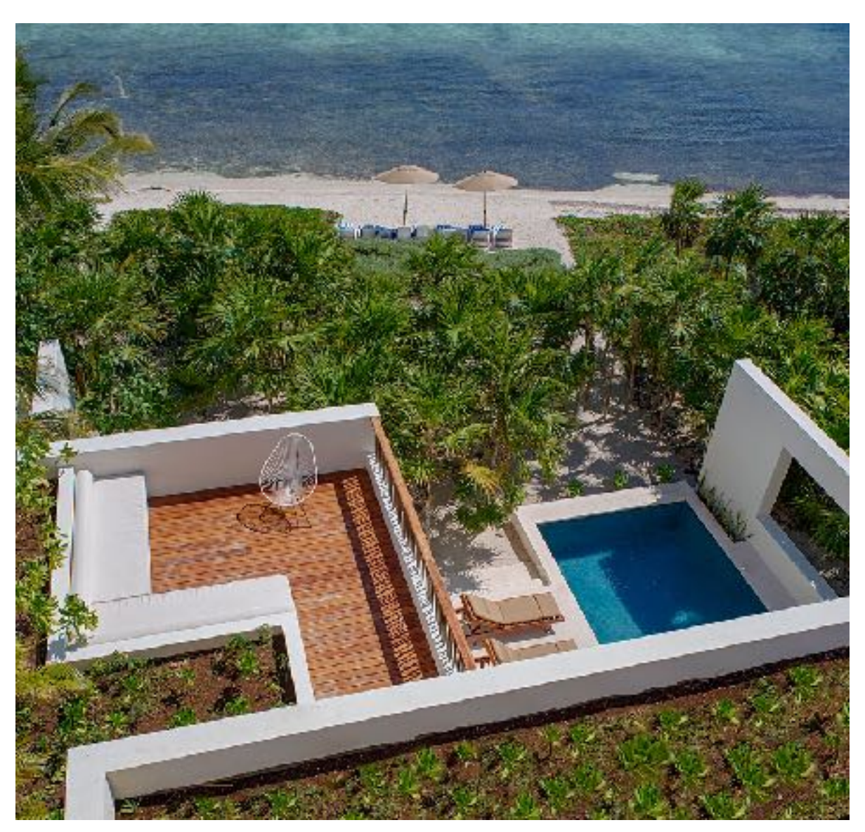
How to Choose the Right Villa for Your Honeymoon

Selecting the right villa for your honeymoon can seem like a daunting task, but with careful consideration, you can find the perfect match. Here are some tips to help you choose the right villa for your honeymoon: